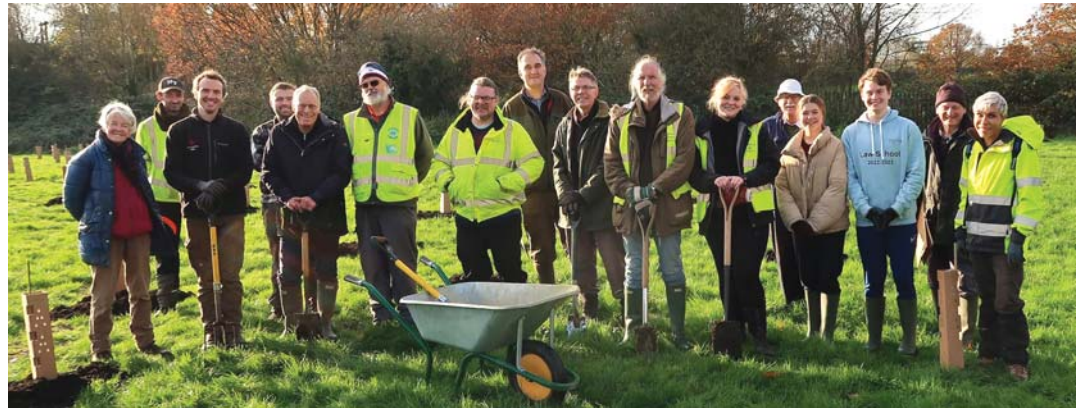
The Tree Warden volunteers and Council staff at the Pleasant Drive recreation area.