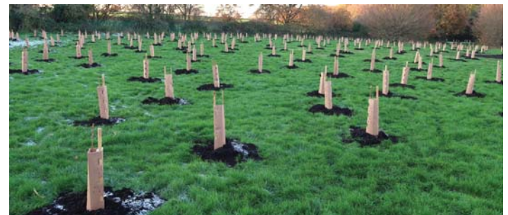
The tree planted landscape at Lake Meadows after the Friends of Lake Meadows volunteers and the Tree Warden volunteers had completed their task!